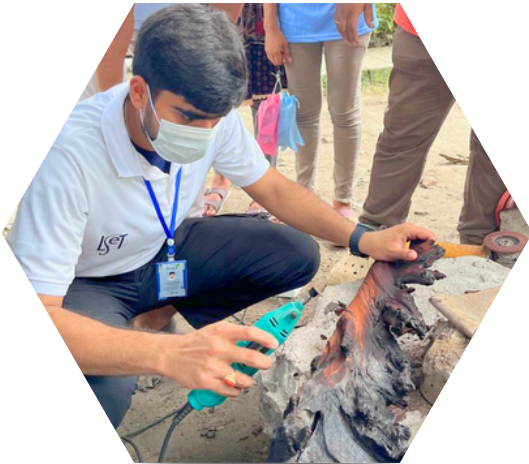
Practical Skill Building

Practical training, Live ecosystem work, and Guided classroom sessions.