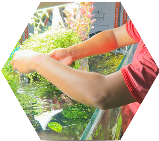
Live Tank Setup

Practical training, Live ecosystem work, and Guided classroom sessions.